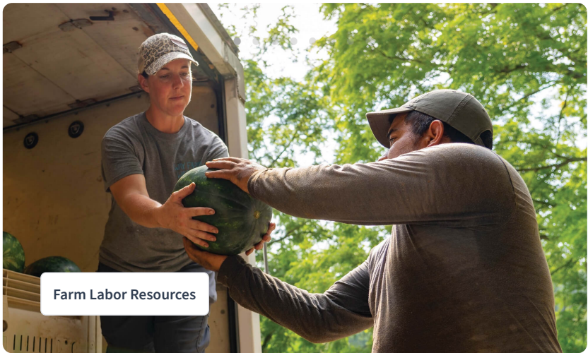
Farm Labor Resources

Labor has always been an issue, mainly because we are a seasonal operation. So that's a challenge finding somebody who only wants to work three months out of the year, sometimes up to six months.